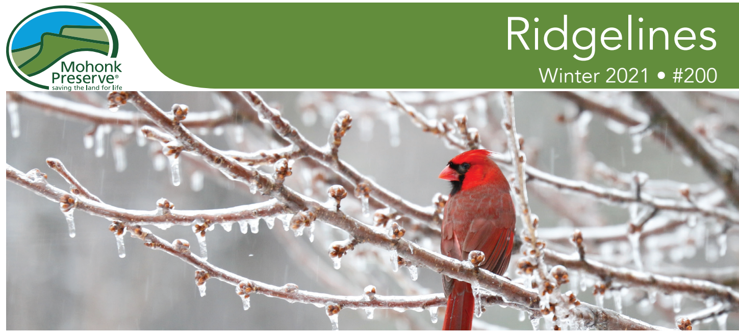
Winter Cardinal

Winter is a great time to bundle up and get into nature at Mohonk Preserve or bring the outdoors inside with one of our upcoming nature webinars.