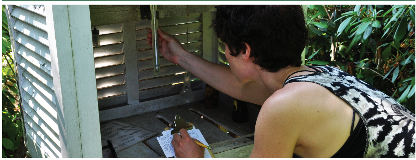
Climate Tracker Recording Weather Data at the Lake Mohonk Weather Station